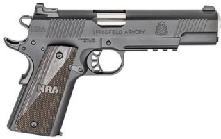
SPRINGFIELD ARMORY 1911 OPERATOR

$1250 Table of 8: Includes reserved table+ 8 dinners+8 chances on the early bird Gun + Sig Sauer P365XL