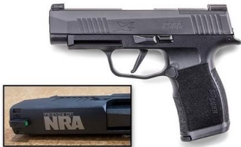
SIG SAUER P365XL WITH FRIENDS OF NRA LOGO