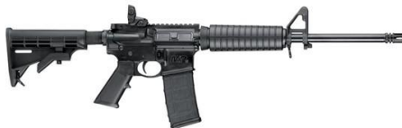
SMITH & WESSON M&P SPORT II

Smith and Wesson MP Sport II .556 or Ruger AR 556