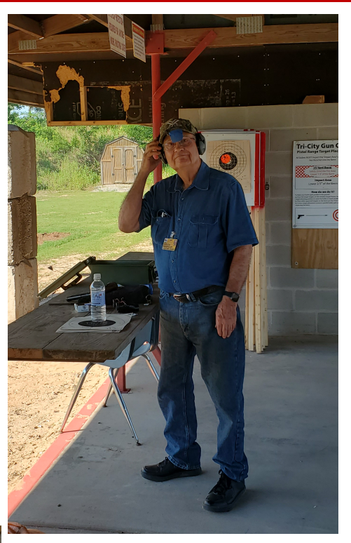
TCGC-Practical Pistol June 06, 2021 Match Results - Combined