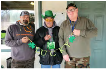
Top 3 Winners